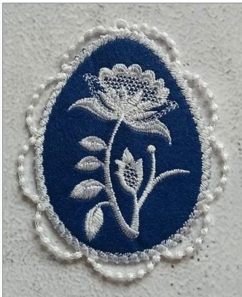
Blueegg01 83.20x99.90 mm; 3.28x3.93"; 10,784 st,

You can also use these designs with brown felt to create „Gingerbread“ version of eggs.