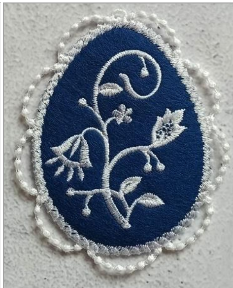
Blueegg02 83.20x99.90 mm; 3.28x3.93"; 9,548 st.