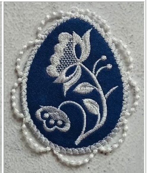
Blueegg03 83.20x99.90 mm; 3.28x3.93"; 10,577 st.