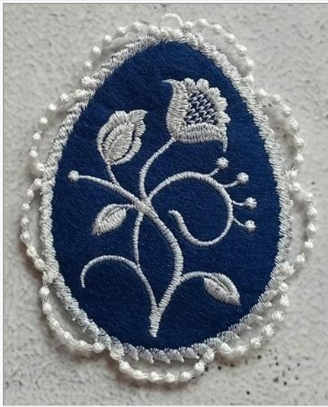
Bluegg04 83.20x99.90 mm; 3.28x3.93"; 9,552 st.