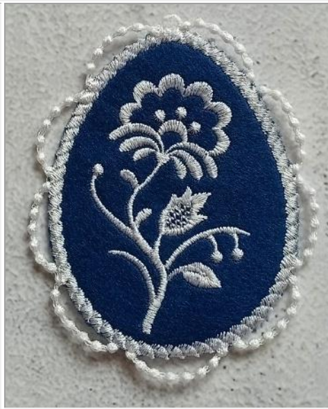
Bluegg05 83.20x99.90 mm; 3.28x3.93"; 8,908 st.