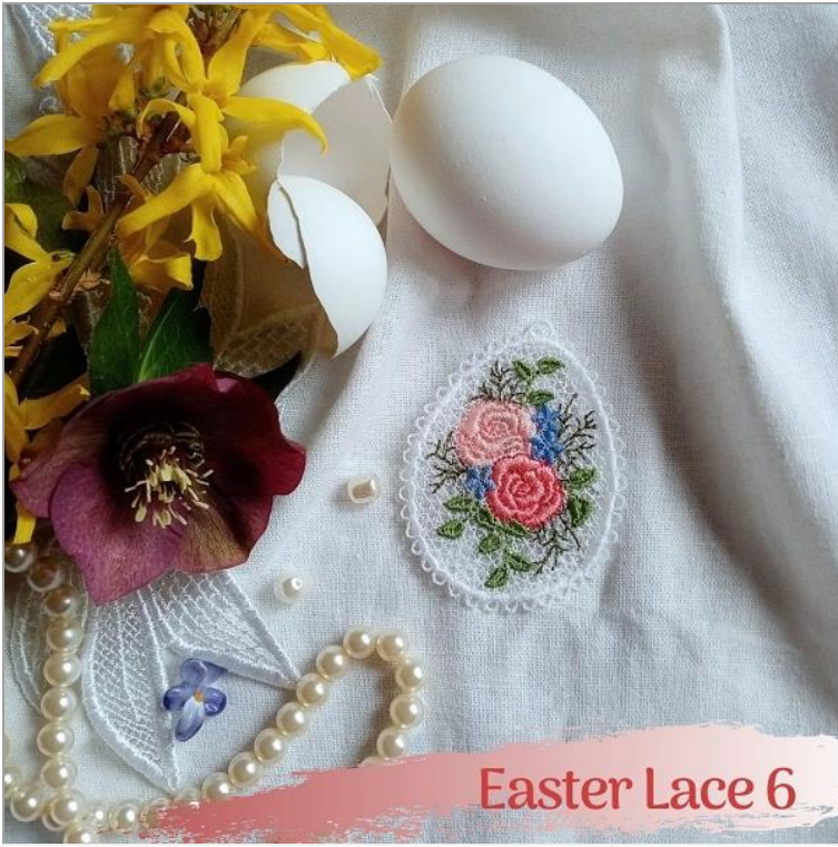
Easter Lace 6

THANK YOU FOR YOUR PURCHASE FROM OREGONPATCHWORKS INC. www.oregonpatchworks.com