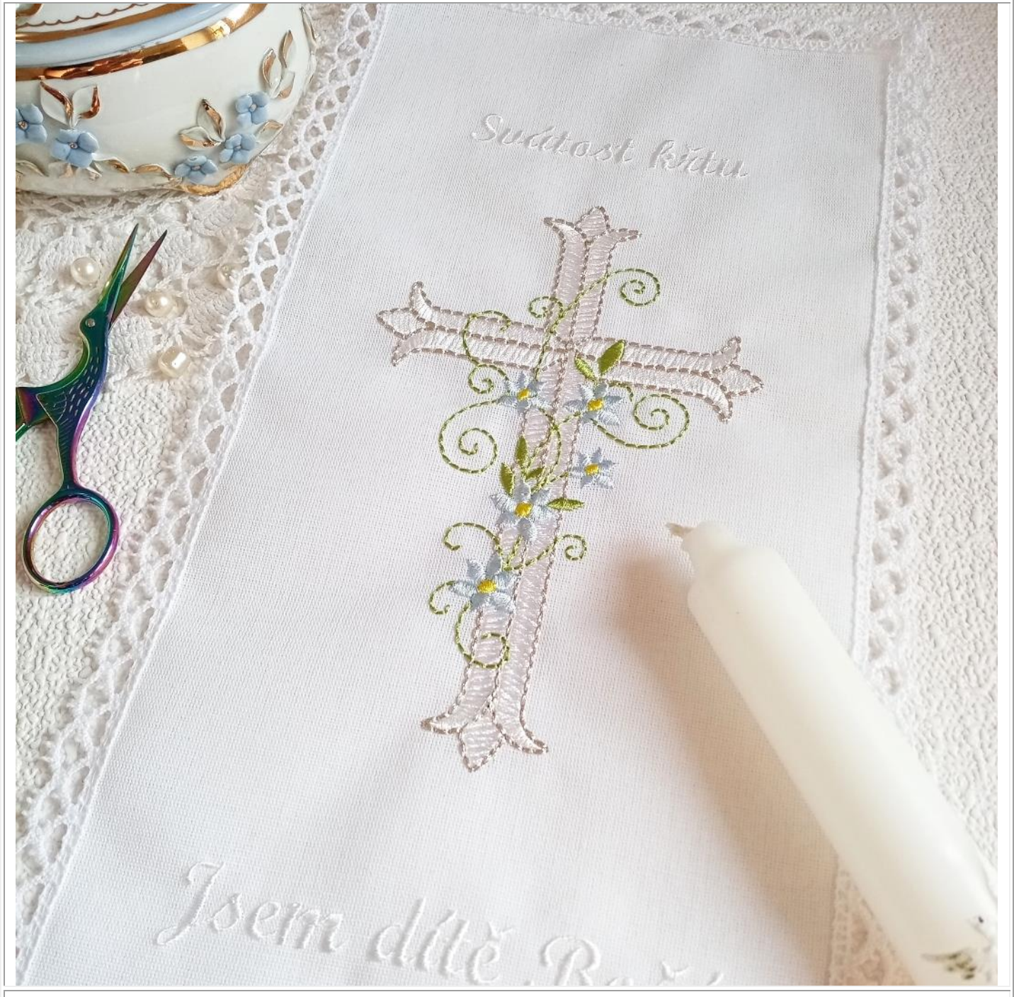
THANK YOU FOR YOUR PURCHASE FROM OREGONPATCHWORKS INC. www.oregonpatchworks.com

The original copyright of these files is owned with all rights reserved by PattiStudio. YOU HAVE PURCHASED A LICENSE TO USE THESE ELECTRONIC FILES. When you purchase or download from OregonPatchWorks Inc, you are granted a single-user license of the files to create stitch outs from them. The ownership of the design stitch files and related graphic files is retained by craftsperson that created them. These digitized embroidery designs and graphics are protected under USA Federal Copyright Law & International Treaties. The design and graphic files themselves, or any part thereof, cannot be sold, duplicated or shared in any way and are for use by the original purchaser/user only.