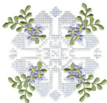
Samp136 94.10x94.10 mm; 9,081 stitches, 4 colors