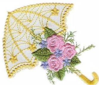
Samp134 75.00x88.50 mm; 10,106 stitches; 5 colors