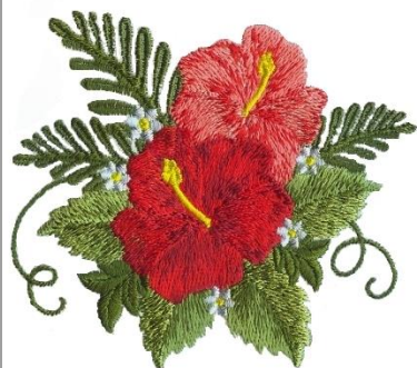
Samp135 100.00x88.10 mm; 17,241 stitches; 9 thread changes; 8 colors