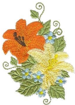
Samp132 64.70x91.50 mm; 10,480 stitches; 7 colors