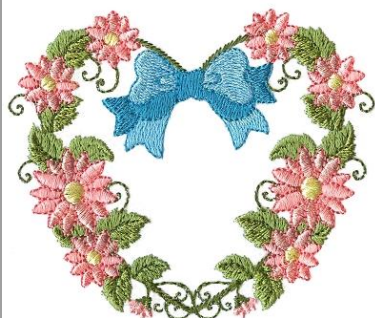
Samp133 100.00x84.90 mm; 17,385 stitches; 11 thread changes; 7 colors