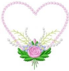
File: Forg13.pes Stitches: 4999 Size: 3.53x3.56 "