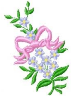
File: Forg15.pes Stitches: 5053 Size: 2.50x3.59 "