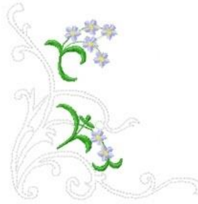
File: Forg14.pes Stitches: 3350 Size: 3.60x3.64 "