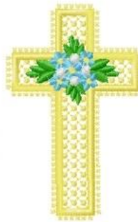
File: Forg17.pes Stitches: 9643 Size: 2.29x3.61 "