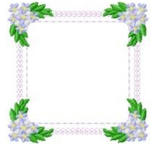
File: Forg18.pes Stitches: 8605 Size: 3.92x3.92 "