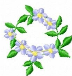
File: Forg20free.pes Stitches: 1690 Size: 1.54x1.59 "