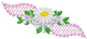
File: Forg19.pes Stitches: 4785 Size: 3.30x1.44 "