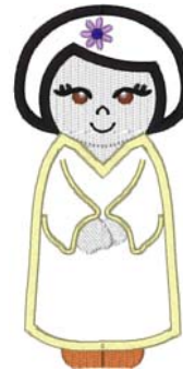
Oriental Princess's 10b - Large.pes 2.81x5.88 inches; 10,119 stitches 12 thread changes; 10 colors