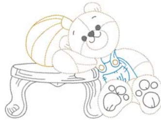
Cuddly Playmates 09 - 5x7.pes 4.91x7.03 inches; 4,933 stitches 7 thread changes; 7 colors