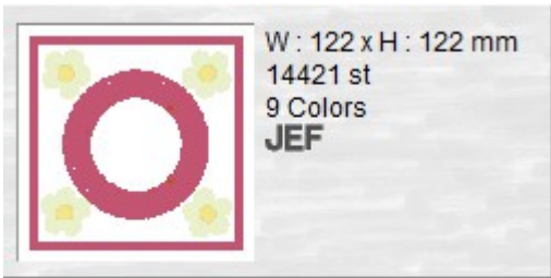
tissue box top panel.JEF