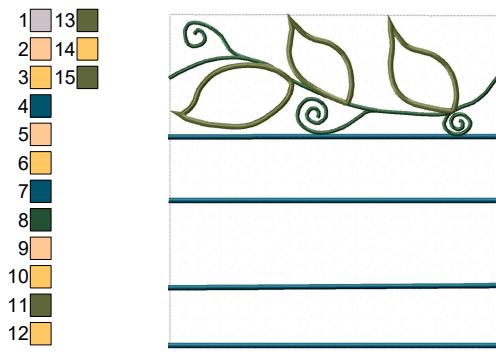
Name: BOM Floral Splendor -2a File: HSCQT186-2a.pes Stitches: 14248 Size: 198.6x197.7 mm Colors: 6/15 Stops: 14