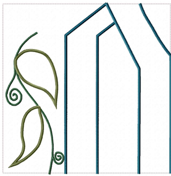
Name: BOM Floral Splendor -14b File: HSCQT186-10b.pes Stitches: 14547 Colors: 6/14 Size: 197.7x199.9 mm Stops: 13