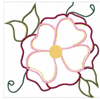
Name: BOM Floral Splendor 2021 -5 File: HSCQT186-5c.pes Stitches: 26578 Colors: 9/43 Size: 198.1x198.6 mm Stops: 42