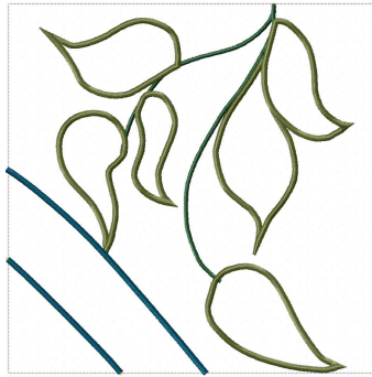
Name: BOM-Floral Splendor 2021 - 11 File: HSCQT186-8a.pes Stitches: 16341 Colors: 6/22 Size: 198.4x199.1 mm Stops: 21