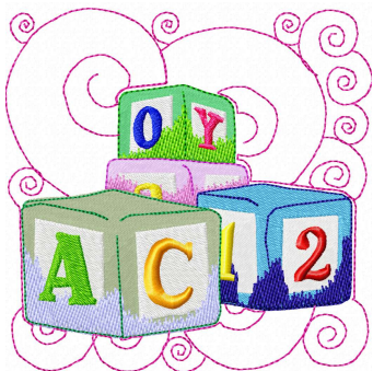
Name: Quilt blocks File: HSCQT117 Blocks pes4 CATIs10.pes Stitches: 24619 Colors: 18/24 Size: 5.00x4.95 " Stops: 23