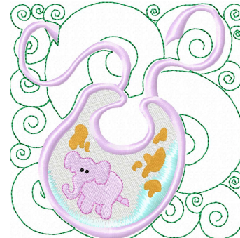
Name: baby quilt File: HSCQT119 Bib PES4 CATIs10.pes Stitches: 19007 Colors: 7/8 Size: 5.00x5.09 " Stops: 7