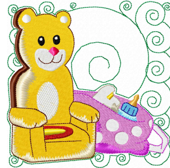
Name: bear chair quilt File: HSCQT122 Bearchair PES4 CAT.p...Is10 Stitches: 25667 Colors: 17/21 Size: 4.98x4.99 " Stops: 20