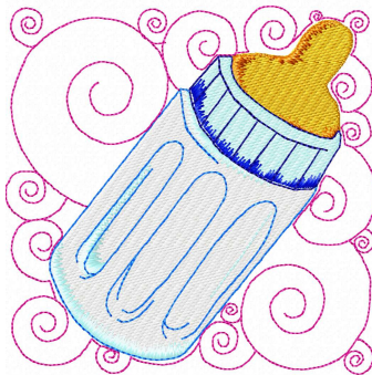
Name: Bottle File: HSCQT115 Bottle PES4 CATIs10.pes Stitches: 18952 Colors: 8/9 Size: 5.02x4.97 " Stops: 8