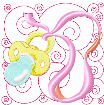
Name: Quilt blocks5 File: HSCQT118 Pacifier PES4 CATLS10.pes Stitches: 13480 Colors: 8/8 Size: 4.96x4.87 " Stops: 7