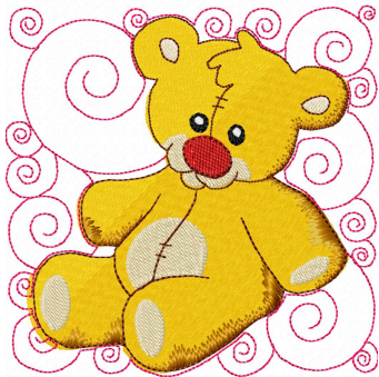
Name: Baby blanket bear File: HSCQT114 Bear PES4 CATIs10.pes Stitches: 22995 Colors: 8/9 Size: 4.99x4.96 " Stops: 8