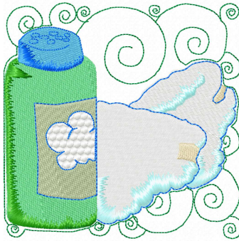
Name: baby powder quilt File: HSCQT121 Powder PES4 CATIs10.pes Stitches: 25490 Colors: 9/12 Size: 5.03x4.97 " Stops: 11