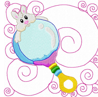
Name: Quilt bunny rattle File: HSCQT116 Rattle pes4 CATIs10.pes Stitches: 15983 Colors: 15/17 Size: 5.00x5.02 " Stops: 16