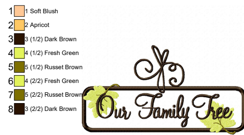
Name: Family tree label File: HSCMI100BLgVer8.pes Stitches: 17328 Size: 7.76x4.20 " Colors: 5/8 Stops: 7