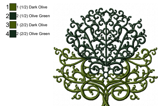
Name: Family tree File: HSCMI100LGVer8.pes Stitches: 37199 Size: 7.70x7.26 " Colors: 2/4 Stops: 3