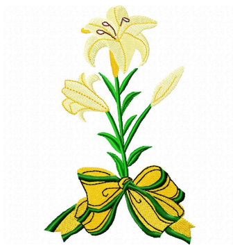
Name: Easter Lily File: HSCHE104cVer4.pes Stitches: 15294 Size: 3.53x5.59 " Colors: 7/10 Stops: 9