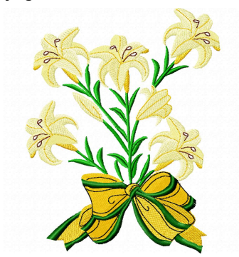
Name: Big Lily File: HSCHE104eVer4.pes Stitches: 31590 Size: 4.92x6.18 " Colors: 7/9 Stops: 8