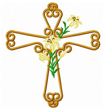
Name: Easter Cross 1 File: HSCHE104BVer4.pes Stitches: 13361 Size: 5.06x5.64 " Colors: 6/12 Stops: 11