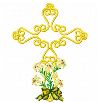
Name: cross File: HSCHE104f1Ver4.pes Stitches: 20629 Size: 5.02x6.63 " Colors: 8/10 Stops: 9