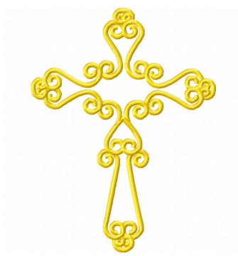
Name: cross File: HSCHE104dVer4.pes Stitches: 7931 Size: 5.04x6.65 " Colors: 1/1 Stops: 0