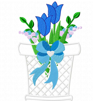
Name: Basket 12 File: HSCFL104LVer4.pes Stitches: 28561 Size: 4.36x6.88 " Colors: 8/12 Stops: 11