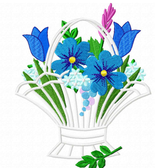
Name: Basket 9 File: HSCFL104iVer4.pes Stitches: 32161 Size: 5.04x6.24 " Colors: 12/21 Stops: 20