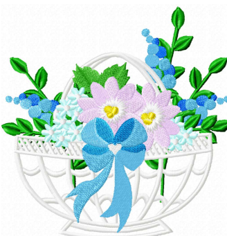
Name: Basket 4 File: HSCFL104dVer4.pes Stitches: 31339 Size: 5.04x5.07 " Colors: 9/15 Stops: 14