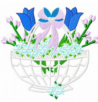
Name: Basket 7 File: HSCFL104gVer4.pes Stitches: 33877 Size: 5.51x5.06 " Colors: 9/13 Stops: 12