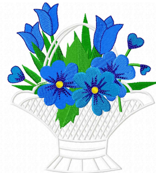
Name: Basket 3 File: HSCFL104cVer4.pes Stitches: 31319 Size: 5.03x5.67 " Colors: 7/13 Stops: 12