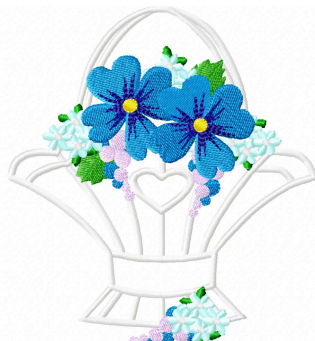
Name: Basket 8 File: HSCFL104hVer4.pes Stitches: 18546 Size: 4.58x5.08 " Colors: 8/11 Stops: 10