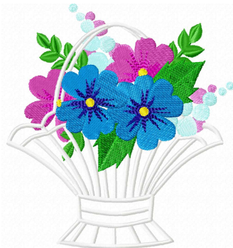
Name: White flower basket a File: HSCFL104aVer4.pes Stitches: 23232 Size: 4.66x5.01 " Colors: 10/11 Stops: 10