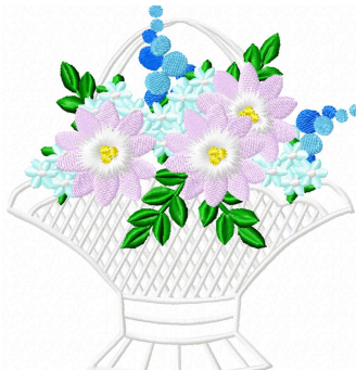
Name: Basket 10 File: HSCFL104jVer4.pes Stitches: 30680 Size: 4.97x5.24 " Colors: 7/9 Stops: 8