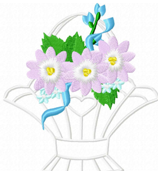
Name: Basket 5 File: HSCFL104eVer4.pes Stitches: 21235 Size: 5.03x5.53 " Colors: 7/9 Stops: 8