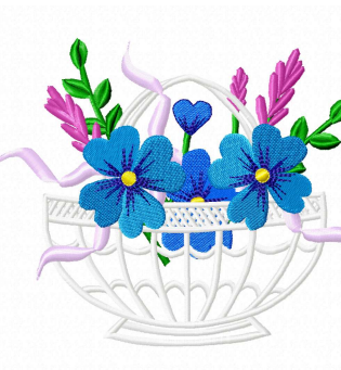
Name: Basket 11 File: HSCFL104kVer4.pes Stitches: 27530 Size: 5.99x5.07 " Colors: 8/10 Stops: 9