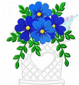
Name: Basket 6 File: HSCFL104fColorChart.pes Stitches: 30443 Size: 5.02x6.06 " Colors: 8/10 Stops: 9