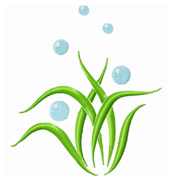
Name: Under the Sea 6 File: HSCFH102bVer5.pes Stitches: 3720 Size: 3.33x3.78 " Colors: 3/3 Stops: 2