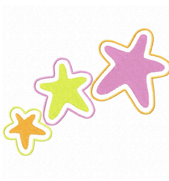
Name: Under the Sea 8 File: HSCFH102dVer5.pes Stitches: 5335 Size: 3.85x2.91 " Colors: 3/6 Stops: 5