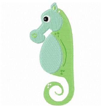
Name: Under the Sea 5 File: HSCFH102aVer5.pes Stitches: 5413 Size: 1.64x3.80 " Colors: 5/7 Stops: 6