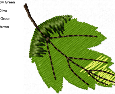
File: HSCFA109bSmleaf.pes Stitches: 1754 Size: 34.4x31.8 mm