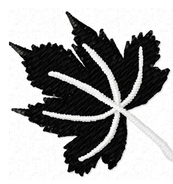
File: HSCFA109bSmmaple.pes Size: 26.2x25.5 mm