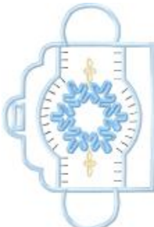
File: FTNOA0526_G.jef Stitches: 13798 Size: 106.4x157.8 mm