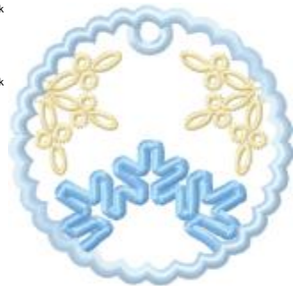
File: FTNOA0526_I.jef Stitches: 6926 Size: 68.6x68.5 mm