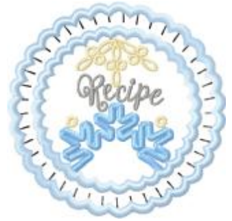
File: FTNOA0526_CC.jef Stitches: 10231 Size: 87.6x87.6 mm