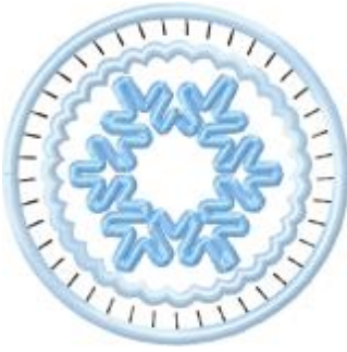
File: FTNOA0526_A.jef Stitches: 9359 Size: 87.4x87.4 mm