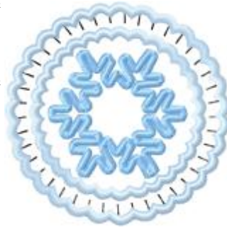
File: FTNOA0526_AA.jef Stitches: 9548 Size: 87.6x87.6 mm