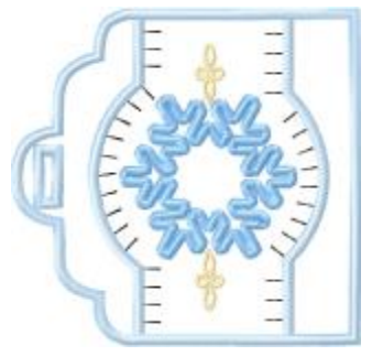
File: FTNOA0526_F.jef Stitches: 12197 Size: 106.3x103.4 mm