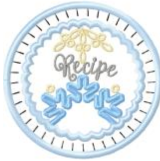
File: FTNOA0526_C.jef Stitches: 10042 Size: 87.4x87.4 mm