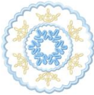
File: FTNOA0526_D.jef Stitches: 17115 Size: 127.2x127.4 mm