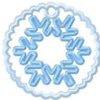
File: FTNOA0526_H.jef Stitches: 6694 Size: 68.6x68.5 mm