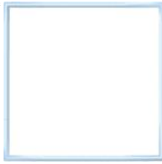
File: FTNOA0526_E.jef Stitches: 4180 Size: 103.5x102.6 mm