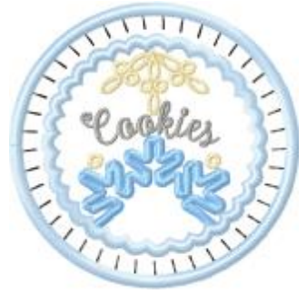
File: FTNOA0526_B.jef Stitches: 9948 Size: 87.4x87.4 mm