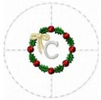
File: FTNOA0294_C.jef Stitches: 1741 Size: 44.4x44.4 mm