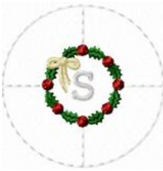
File: FTNOA0294_S.jef Stitches: 1793 Size: 44.4x44.4 mm