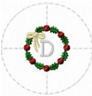
File: FTNOA0294_D.jef Stitches: 1768 Size: 44.4x44.4 mm