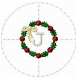
File: FTNOA0294_J.jef Stitches: 1733 Size: 44.4x44.4 mm