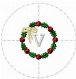
File: FTNOA0294_V.jef Stitches: 1752 Size: 44.4x44.4 mm