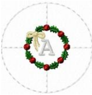
File: FTNOA0294_A.jef Stitches: 1796 Size: 44.4x44.4 mm