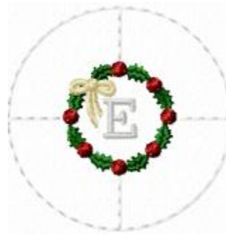
File: FTNOA0294_E.jef Stitches: 1817 Size: 44.4x44.4 mm