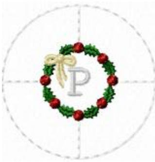
File: FTNOA0294_P.jef Stitches: 1777 Size: 44.4x44.4 mm