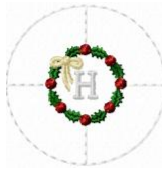
File: FTNOA0294_H.jef Stitches: 1825 Size: 44.4x44.4 mm