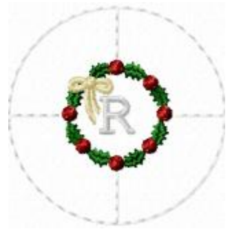
File: FTNOA0294_R.jef Stitches: 1807 Size: 44.4x44.4 mm