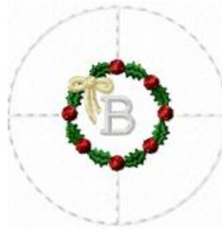
File: FTNOA0294_B.jef Stitches: 1824 Size: 44.4x44.4 mm