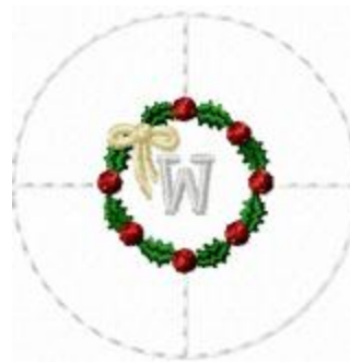
File: FTNOA0294_W.jef Stitches: 1808 Size: 44.4x44.4 mm