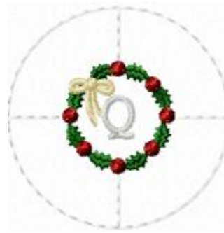
File: FTNOA0294_Q.jef Stitches: 1782 Size: 44.4x44.4 mm