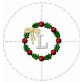
File: FTNOA0294_L.jef Stitches: 1763 Size: 44.4x44.4 mm