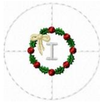
File: FTNOA0294_I.jef Stitches: 1754 Size: 44.4x44.4 mm