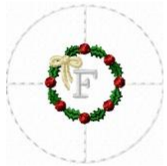
File: FTNOA0294_F.jef Stitches: 1802 Size: 44.4x44.4 mm