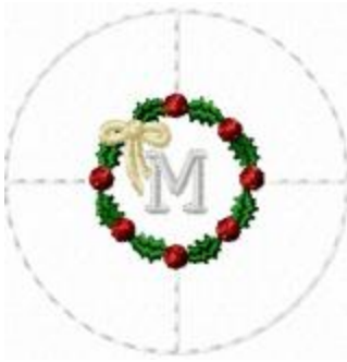
File: FTNOA0294_M.jef Stitches: 1843 Size: 44.4x44.4 mm