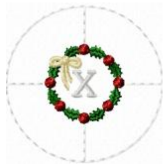
File: FTNOA0294_X.jef Stitches: 1812 Size: 44.4x44.4 mm