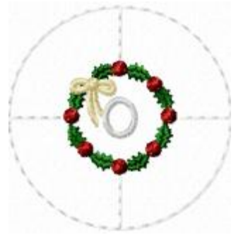
File: FTNOA0294_O.jef Stitches: 1747 Size: 44.4x44.4 mm