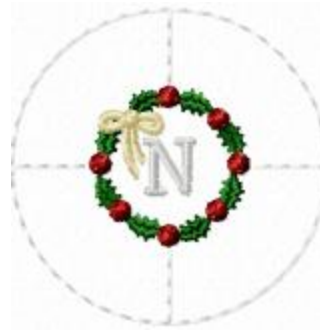
File: FTNOA0294_N.jef Stitches: 1822 Size: 44.4x44.4 mm