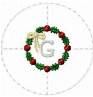
File: FTNOA0294_G.jef Stitches: 1780 Size: 44.4x44.4 mm