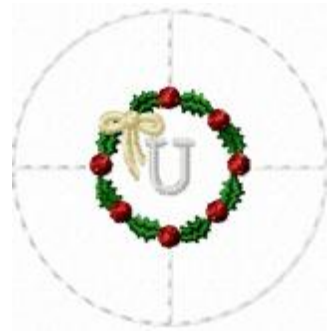
File: FTNOA0294_U.jef Stitches: 1759 Size: 44.4x44.4 mm