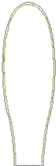
Bunny Ear Left.pes 2.17x6.72 inches; 685 stitches 3 thread changes; 3 colors