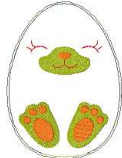
Bunny Body.pes 4.91x6.78 inches; 9,216 stitches 7 thread changes; 7 colors