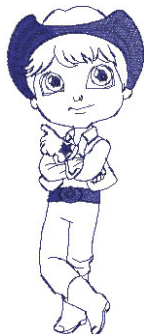
Cce022_country Boys_6.art 2.69x6.54 inches; 5,723 stitches 1 thread changes; 1 colors