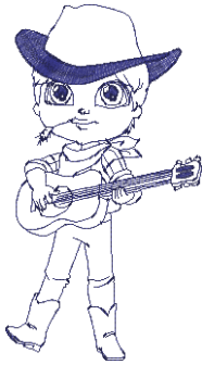
Cce022_country Boys_1.art 3.82x7.01 inches; 7,705 stitches 1 thread changes; 1 colors