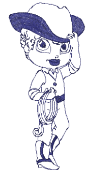
Cce022_country Boys_7.art 3.10x6.88 inches; 7,238 stitches 1 thread changes; 1 colors