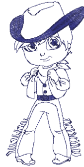
Cce022_country Boys_10.art 3.29x6.80 inches; 7,136 stitches 1 thread changes; 1 colors