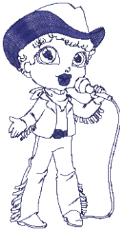
Cce022_country Boys_2.art 3.60x6.92 inches; 9,230 stitches 1 thread changes; 1 colors