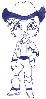
Cce022_country Boys_8.art 3.07x6.94 inches; 6,790 stitches 1 thread changes; 1 colors