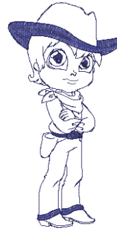
Cce022_country Boys_9.art 3.42x6.86 inches; 6,054 stitches 1 thread changes; 1 colors