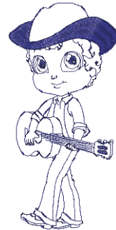
Cce022_country Boys_3.art 3.16x6.55 inches; 7,060 stitches 1 thread changes; 1 colors