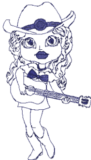
Country Girls_4.art 3.87x7.01 inches; 9,356 stitches 1 thread changes; 1 colors