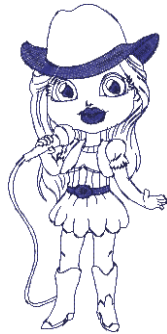
Country Girls_1.art 3.35x6.96 inches; 8,257 stitches 1 thread changes; 1 colors