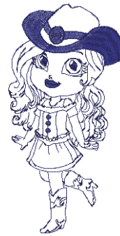
Country Girls_9.art 3.45x6.90 inches; 10,275 stitches 1 thread changes; 1 colors