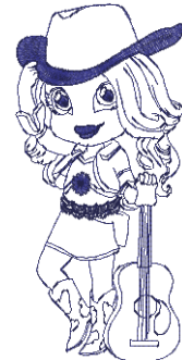
Country Girls_5.art 3.22x6.85 inches; 10,092 stitches 1 thread changes; 1 colors