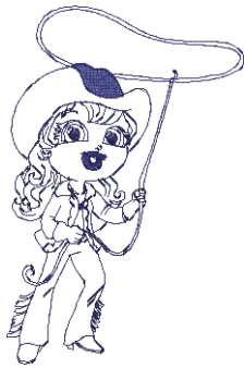
Country Girls_8.art 4.52x6.83 inches; 8,127 stitches 1 thread changes; 1 colors