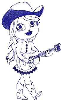
Country Girls_2.art 4.31x7.02 inches; 9,090 stitches 1 thread changes; 1 colors