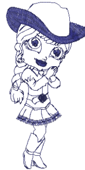
Country Girls_10.art 3.35x6.96 inches; 7,805 stitches 1 thread changes; 1 colors