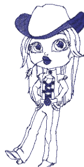
Country Girls_7.art 3.40x6.93 inches; 7,823 stitches 1 thread changes; 1 colors