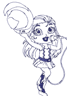
Country Girls_3.art 4.79x6.91 inches; 8,184 stitches 1 thread changes; 1 colors