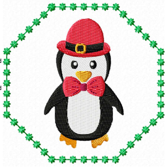
File: winterdesigns_01.jef Stitches: 5693 Size: 85.2x84.2 mm Colors: 6/10 Stops: 9