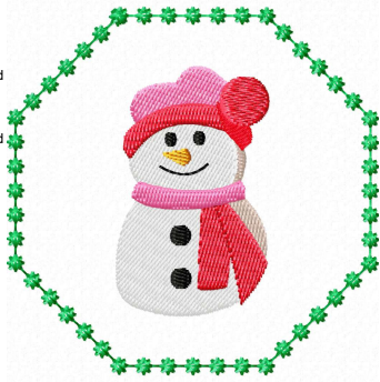
File: winterdesigns_04.jef Stitches: 4719 Size: 85.2x84.2 mm Colors: 7/8 Stops: 7