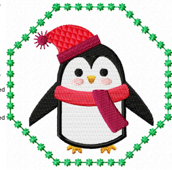
File: winterdesigns_03.jef Stitches: 7149 Size: 85.2x84.2 mm Colors: 7/11 Stops: 10