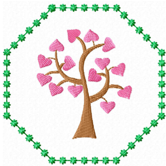
File: winterdesigns_07.jef Stitches: 3143 Size: 85.2x84.2 mm Colors: 3/3 Stops: 2