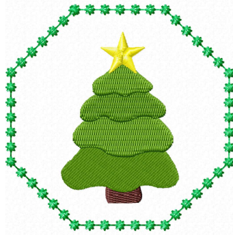
File: winterdesigns_05.jef Stitches: 4308 Size: 85.2x84.2 mm Colors: 4/4 Stops: 3