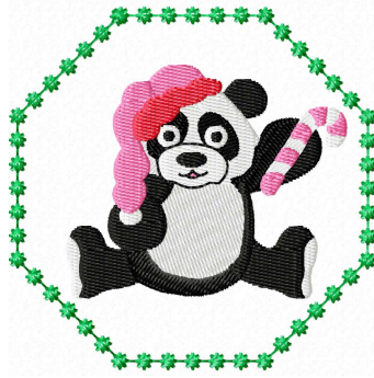
File: winterdesigns_02.jef Stitches: 7338 Size: 85.2x84.2 mm Colors: 6/10 Stops: 9